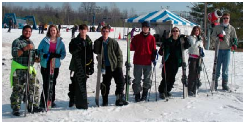
SENIORS SKI LIBERTY , February 11, 2009.