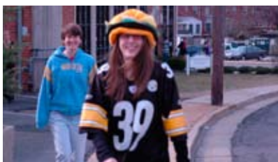
HAT & JERSEY DAY SPIRIT