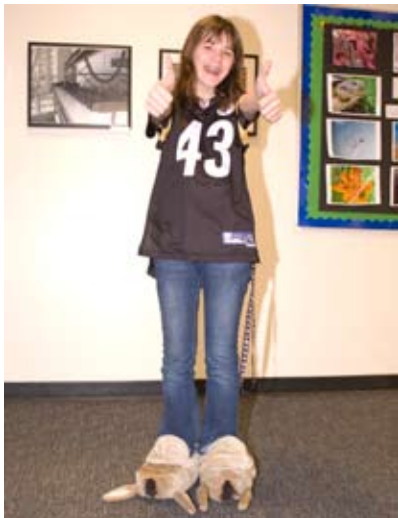
CRAZY SLIPPERS DAY gets two thumbs up.