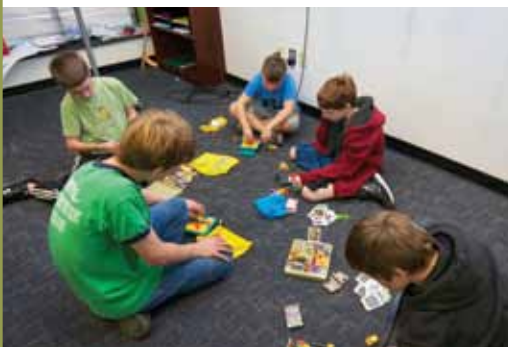
Middle schoolers enjoy using ThinkFun games to sharpen visual perceptual abilities.