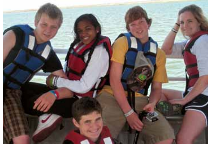
HIGH SCHOOL BIOLOGY STUDENTS STUDY MARINE LIFE DURING SMITH ISLAND FIELD TRIP.