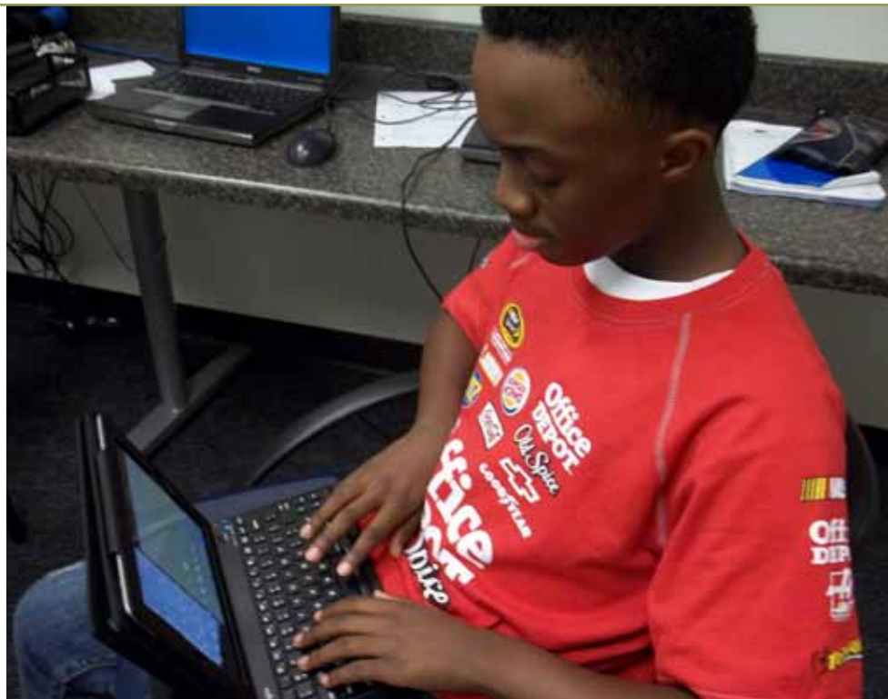
NINTH GRADERS use iPads docked to keyboards to edit compositions created by electronic dictation.

This year, we introduced an electronic organization system using Google Docs and Cloud technology to help facilitate the writing process and executive functioning skill development as we prepare students for the growing electronic global world. For all Writing classes, we mapped our master notebook system to a digital version using Google Docs and corresponding color-coded digital folders, along with sub-folders for tabs. (All senior classes notebooks were also converted, making 12th grade a virtually paperless year.) Students can access their e-binder anywhere, anytime, confident that they always have the most current version of their work, as well as class notes, assignments, and teacher