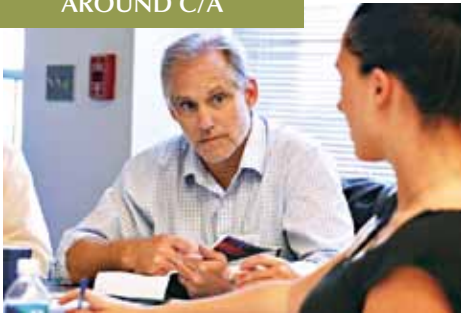
▲ WHERE WERE YOU DURING THE EARTHQUAKE? C/A faculty and staff were at school, attending a full-day workshop by CHADD entitled "Teacher to Teacher: Classroom Interventions for the Student with AD/HD."