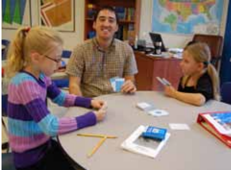
▲ LS MATH. Lower schoolers brush up on math skills while playing "Less Than You."