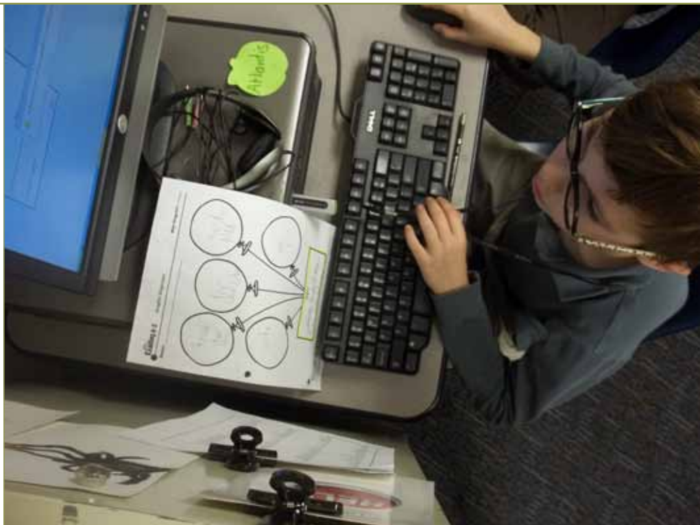
A LOWER SCHOOLER uses a graphic organizer to outline a personal memoir about the day he got his first LEGO® set, which was from the Star Wars collection.