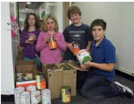
▲ FOOD FOR OTHERS. Lower schoolers practice categorizing and math skills as they sort, count, and pack food to send to Food for Others for distribution to the needy.