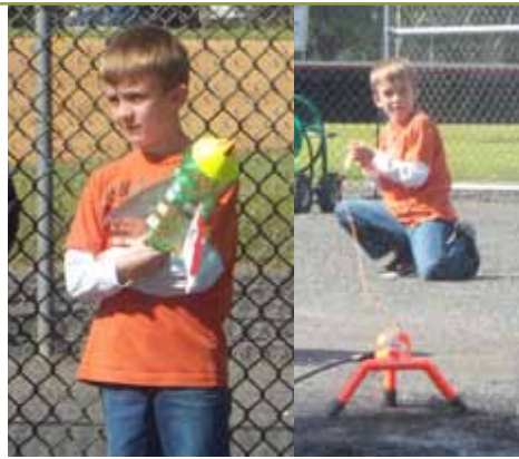
▲ BOTTLE ROCKETS. Lower schoolers build and launch bottle rockets as they study Newton's Three of Laws of Motion.