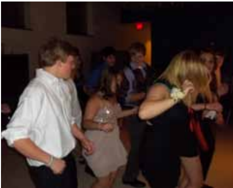
▲ HOMECOMING DANCE. The Cha Cha Slide was a great hit at the High School Homecoming Dance in October.