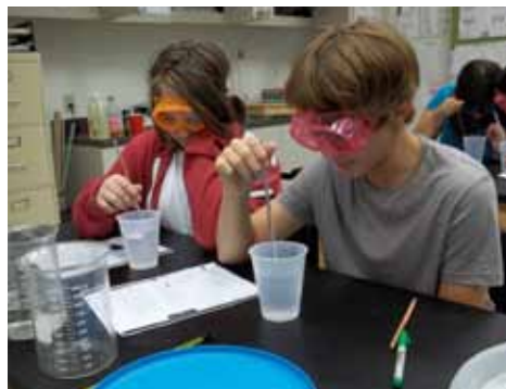
▲ MS PHYSICAL SCIENCE. Students timed the rate it took ice to melt as they studied the chemical changes of solids to liquids.