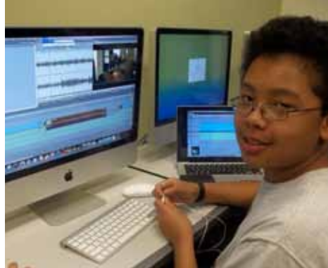
▲ WEDNESDAY CLUBS. C/A middle and high school students explore their passions—from art, to robotics, to mixing music, and more—every week during Wednesday Clubs.