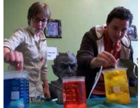
▲ HALLOWEEN was celebrated throughout the halls and classrooms of C/A. From the LS writing exercise, Mystery Candy, to HS chemistry, Halloween provided a fun framework for learning. And of course, there were the requisite ghosts, goblins, superheroes, and iconic characters in glorious costumes, plus snacks, games, and dancing. ▼