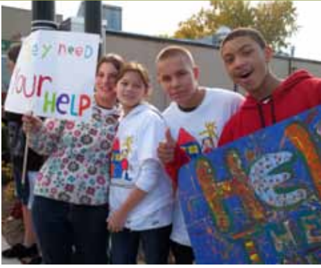
▲ FANNIE MAE'S HELP THE HOMELESS WALK. C/A students and faculty walked the walk in November and raised $2,640 for Food for Others.