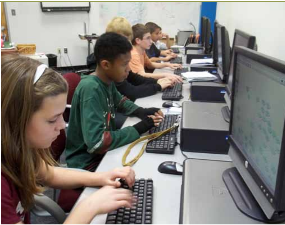
MIDDLE SCHOOL STUDENTS use Inspiration to map out and organize the ideas they will include in a narrative paper about five people they admire.