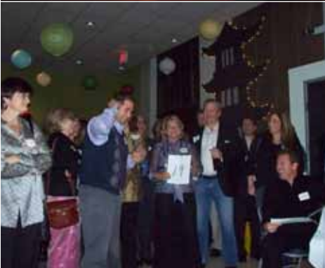
▲ ESCAPE TO THE ORIENT. Thanks to a wonderful effort by CAPA, 135 parents, faculty, and staff enjoyed a fun-filled, Orient-themed Café Night—and raised $30,000 for C/A's educational program. Beautiful decorations, fabulous food, and great auction and raffle items made for a very successful evening of fellowship and fun.