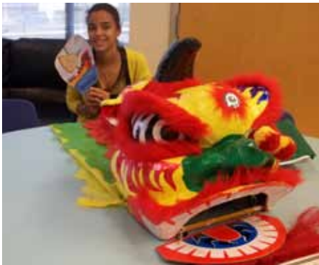
▲ HS HISTORY. In a co-curricular activity with the art department, students chose an ancient Chinese dynasty, learned and wrote about its influence on society, and painted fans with symbols representing the dynasty.